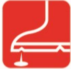
Anti-Penetration Steel Midsole