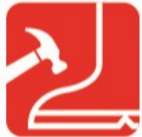
Steel Toe Cap