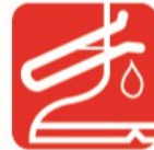
Chemical Resistant Outsole (Common Acids and Alkalis)